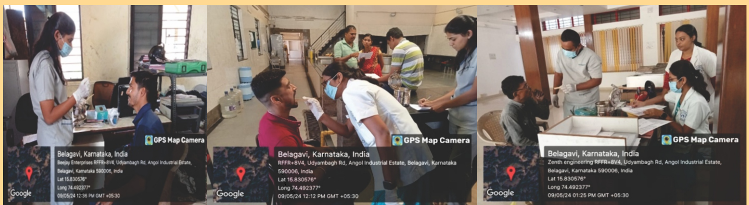
Beejay Industries, Udyambag

MAY 24 No. of Camps Conducted : 10 No. of Patients Screened : 1,392