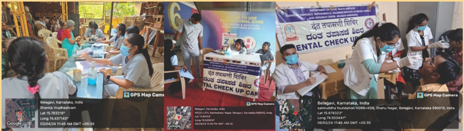
Shanthai Old age Home

APRIL 24 No. of Camps Conducted : 06 No. of Patients Screened : 142