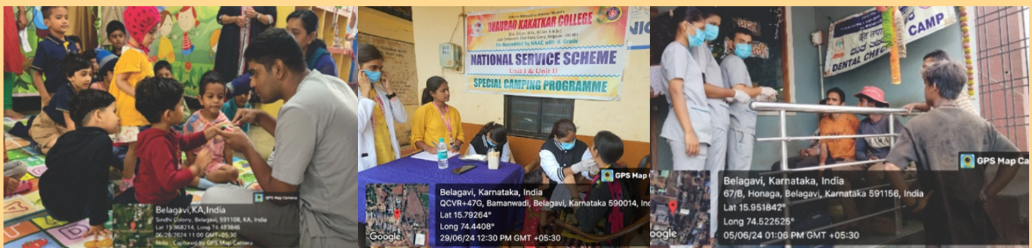
Playway Dale, Vinayak Nagar

JUNE 24 No. of Camps Conducted : 04 No. of Patients Screened : 363